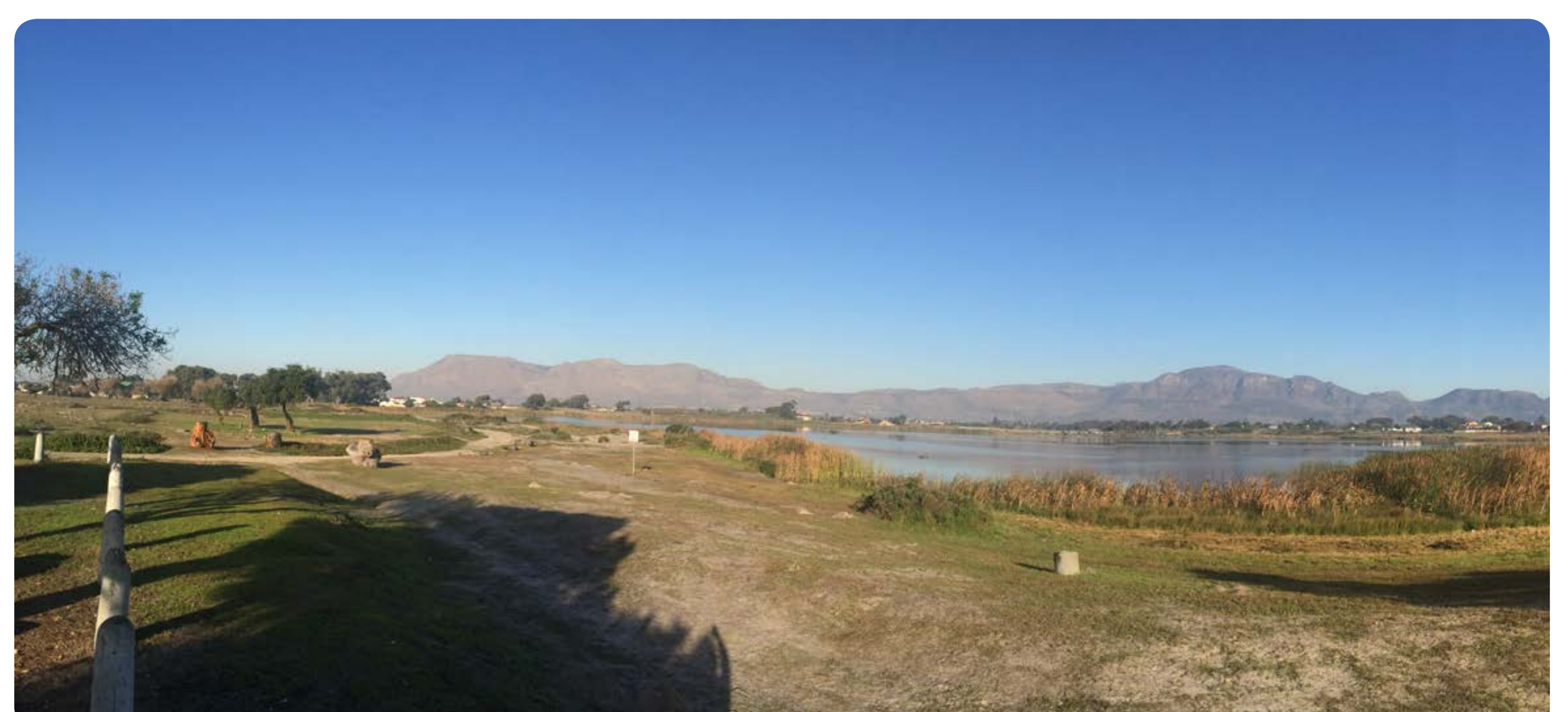
The site presents many opportunities for passive recreation, including picnicking and braaing.