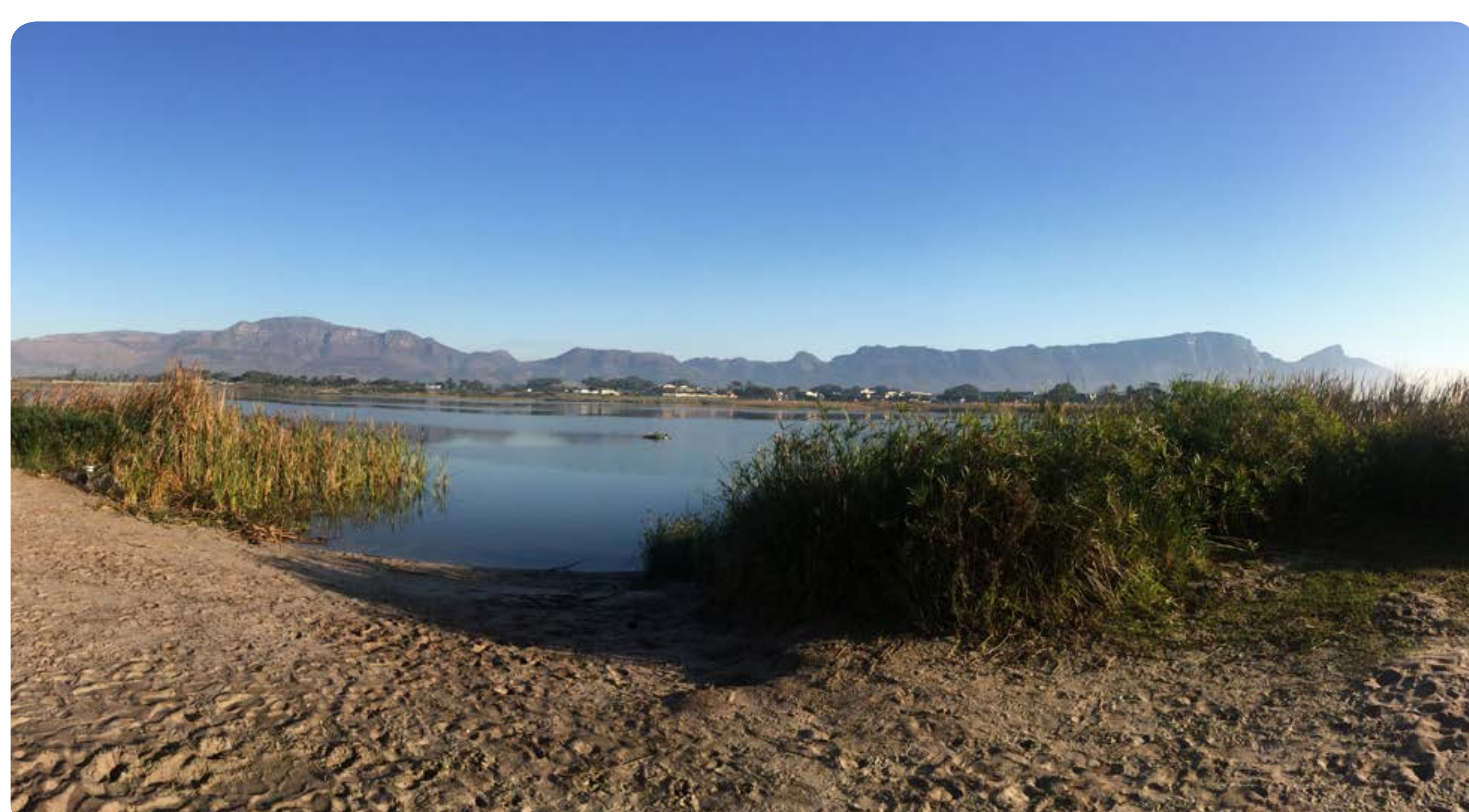
Mountain views across the vlei with direct access to waters edge.