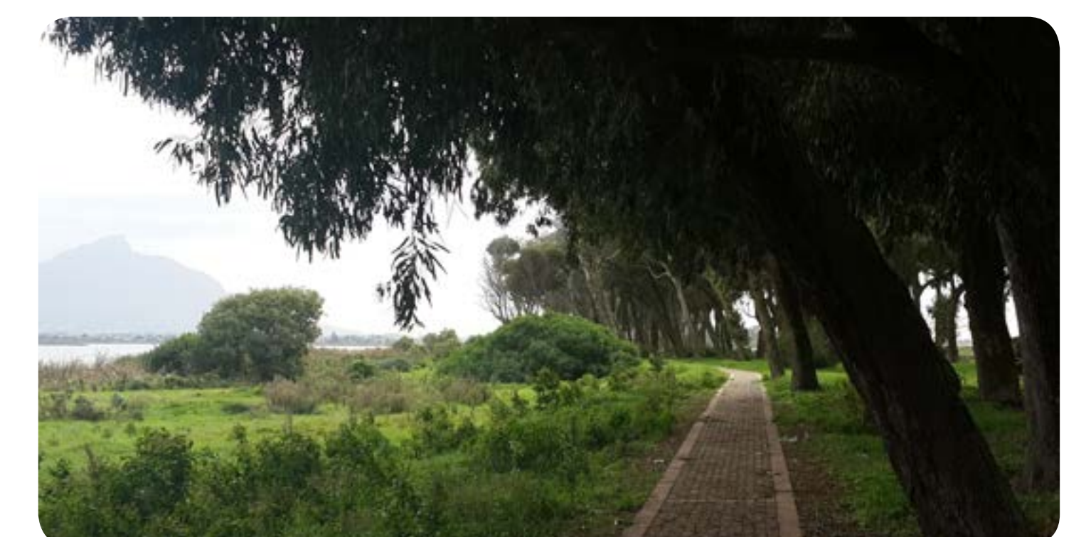
Walkway at False Bay Ecology park