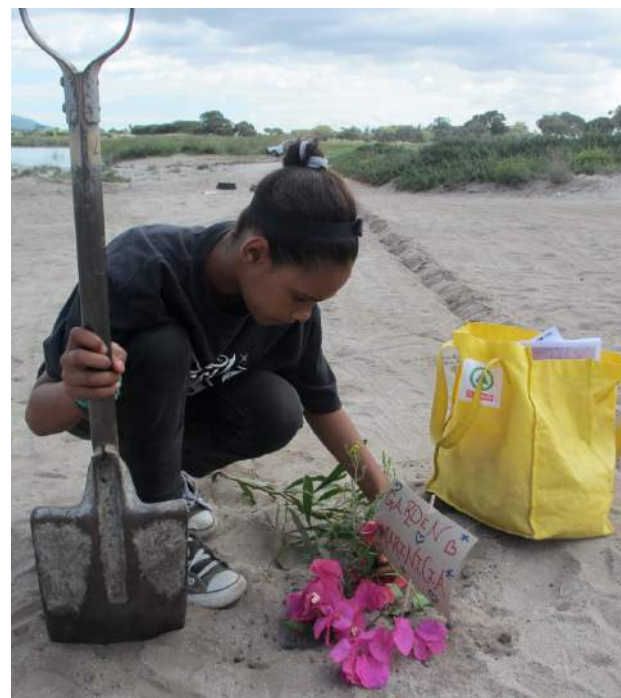
Figure 10 A young Princess Vlei supporter shows her ideas for the space

We look forward to continuing this conversation.