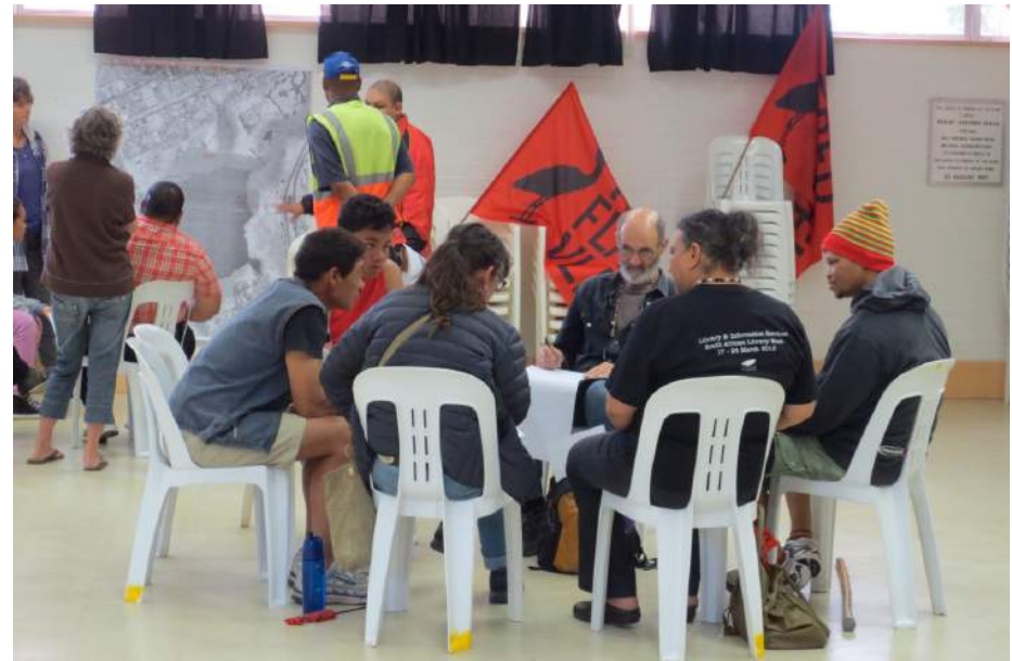
Figure 2: Group discussion at a workshop to discuss a vision for Princess Vlei

This document summarises the findings of these processes. We believe that it provides a solid springboard for developing a relevant and visionary plan for Princess Vlei that can be synthesised with the existing Management Plan of the area. We hope that the City authorities take this groundwork into account, should the mall proposal be scrapped and other options considered for Princess Vlei.