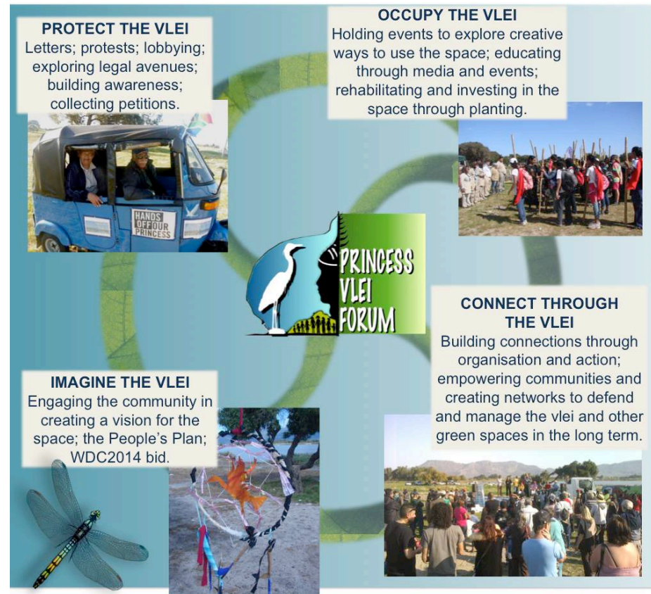
Figure 1 The work of Princess Vlei Forum