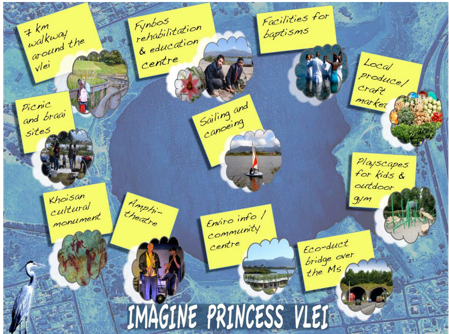
Figure 8 The People's Plan

The People's Plan encapsulates some of these ideas, and provides a springboard for discussion. It is not a blue print, but an expression what people have identified as possible features of the park. These are described in more detail on the following page.