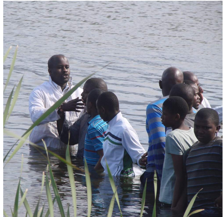
Figure 7: Princess Vlei has long been a site of spiritual connection.

In addition, an urban nature park of this kind contributes significantly towards increasing the well-being of the community, and assists in mitigating the negative effects of poverty. Engaging in this project in the short and long term will increase human capacity in the area, build community and mutual trust, and empower community through building networks.