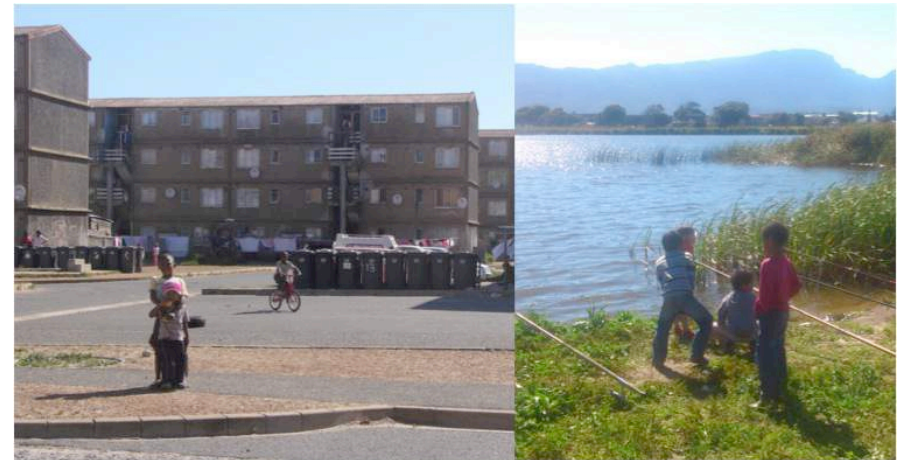
Figure 3 Princess Vlei is a vital green lung for the bleak housing estates in the area, reconnecting urbanised communities with nature.

Situated on the border between formerly “coloured” and white group areas, and accessible to both wealthy and poor, the Princess Vlei is ideally located to offer a meeting point for Capetonians from diverse backgrounds. It can also provide much needed green and recreational space for the bleak lower income housing estates nearby. However, its proximity to lower income communities mean that its resource base is limited, and it also faces the security challenges of any open space in this context. Community engagement, and creating a space that has multiple uses and attractions will help to mitigate against these concerns.