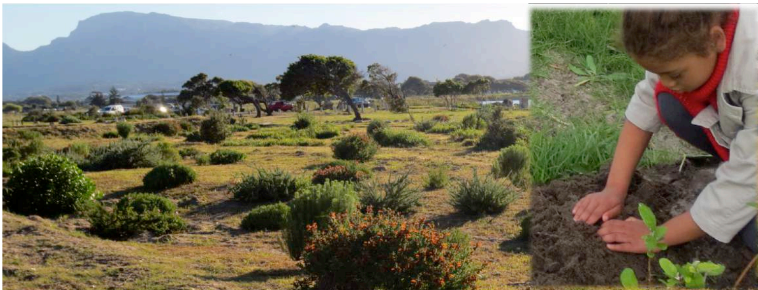
Figure 4 Fynbos garden planted by high school students. Community efforts such as this have transformed the area.

Princess Vlei also offers an opportunity to reconnect highly urbanised societies with nature, and to be a centre of practice for community rehabilitation projects throughout the region. To do this, it needs to be accessible to these communities, which means it needs to serve a recreational as well as conservation function. It is important to remember that the passion with which people have defended this space is because it has always been accessible – they have grown up there, played there, swum there, fished there. People are passionate about the nature at the site because they have had the opportunity to be in it. Had it been fenced off with limited access, they would have little connection, and would not have come to its defence.