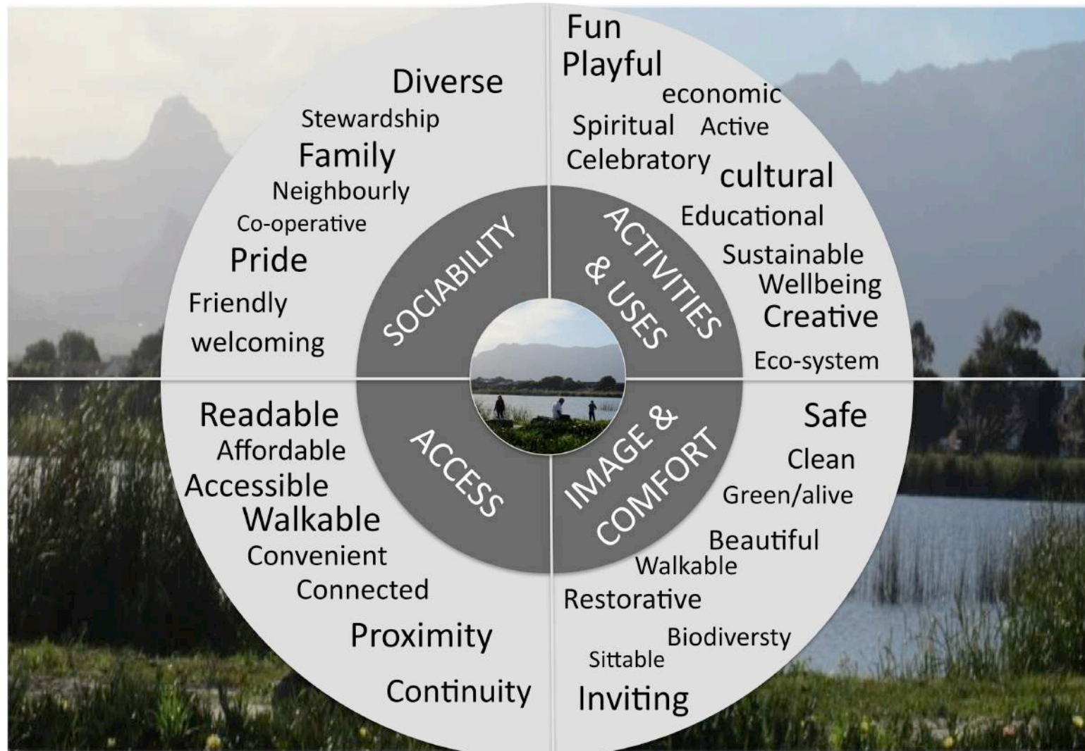
Figure 9 Project for Public Spaces: What makes a great place?

Another helpful paradigm which has guided our engagement with groups is the Project for Public Spaces quadrant of what makes a great place. This is a modified illustration of the model. On the following page we summarise suggestions for how these four important elements can be applied to Princess Vlei: