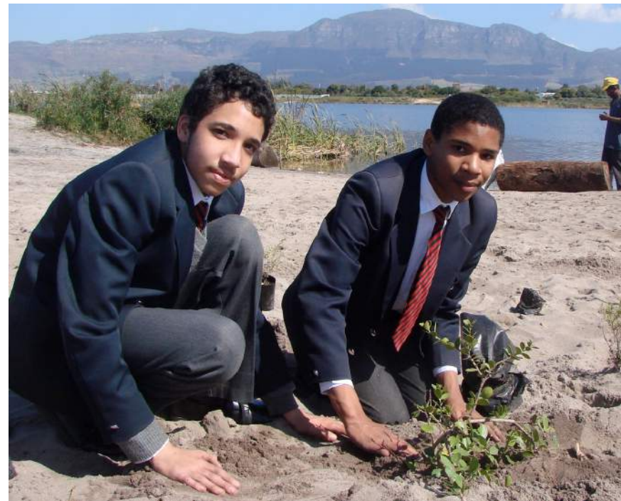
Figure 6 Planting enables the children to feel a real connection with the earth. They make a difference, and build a future.

In the course of exploring the vision with different groups, and in the course of engaging with different types of activity on the vlei, we have identified many such opportunities. This is why we entered the project under the theme of Building Bridges in the World Design Capital. These opportunities are explored below: