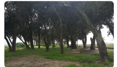
Braai areas at False Bay Ecology park under the shade of eucalyptus trees.

Possible tree species Eucalyptus Ficus Syzygium cordatum