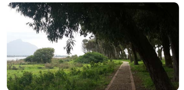
Walkway at False Bay Ecology park